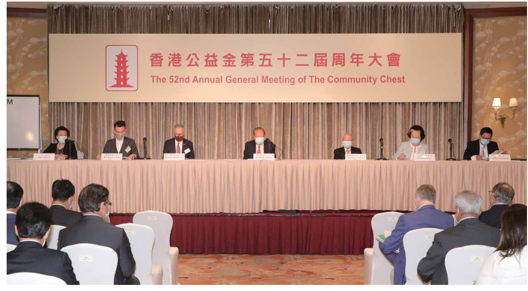
董事名單 List of directors