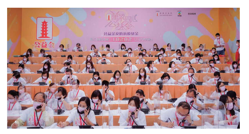
公益金及時抗疫基金 - 長江捐款熱線

The Community Chest Pandemic Rainbow Fund - Cheung Kong Donation Hotline.