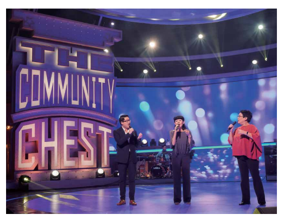
一家三位善長齊齊參與「百萬唱」為公益金籌款。 A family of three participates in the "Sing for a Million" segment.

Members of the event's Organising Committee participate in the "Super Trio" segment.