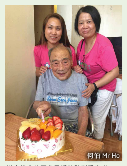
惜食堂食物回收及援助計劃受惠者 A Beneficiary of Bo Charity Foundation Limited - the Food Angel Food Rescue and Assistance Programme