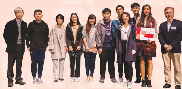
社創組冠軍 — 來自香港中文大學的隊伍。

The Fund-raising Stream Champion – Students from Technological and Higher Education Institute of Hong Kong.