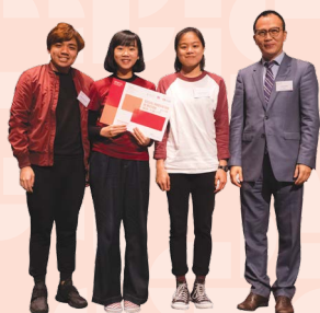
籌款組冠軍 — 來自香港高等教育科技學院的隊伍。

The Fund-raising Stream Champion – Students from Technological and Higher Education Institute of Hong Kong.