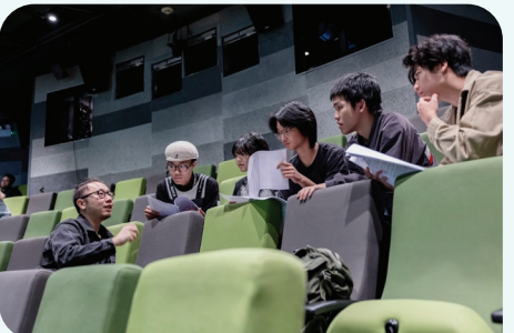
一掃睇片 Scan to watch