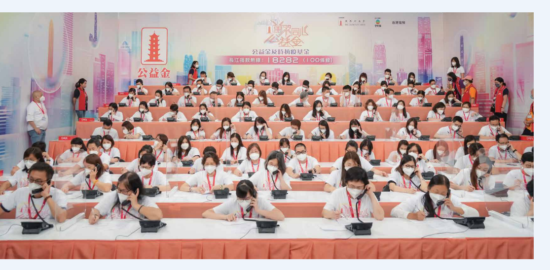
公益金及時抗疫基金 -- 長江捐款熱線。

The Community Chest Pandemic Rainbow Fund – Cheung Kong Donation Hotlines.