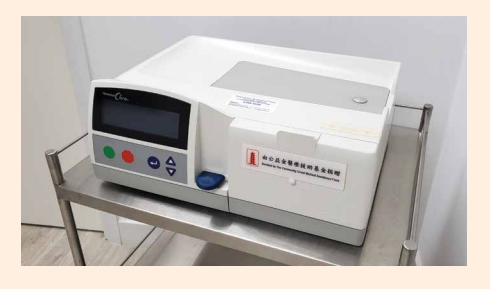
公益金醫療援助基金捐贈之自動腹膜透析機。 An automated peritoneal dialysis machine donated by The Community Chest Medical Assistance Fund.

相關的服務及申請審批由指定的公益金會員機構負責,以確保款項用於合資格的有需要人士。