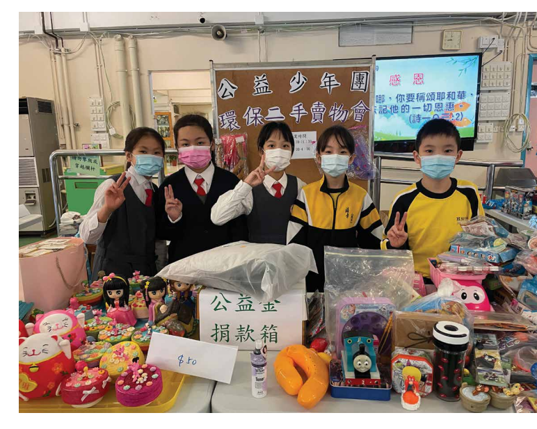
公益少年團九龍城區學生舉辦環保二手賣物會。 Members of the Community Youth Club (Kowloon City District) organise a used goods sale.

The Chest sincerely expresses its gratitude to the Education Bureau and the Community Youth Club Executive Committees from 18 districts for their support so that students could participate in different environmental protection activities for creating an environment conducive to sustainable development.